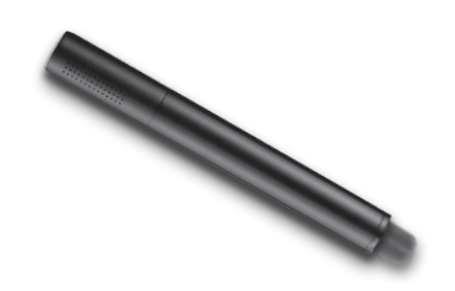
Note: UV radiation and extreme temperature can affect the color and structure of the surface of the structured BLACK version.